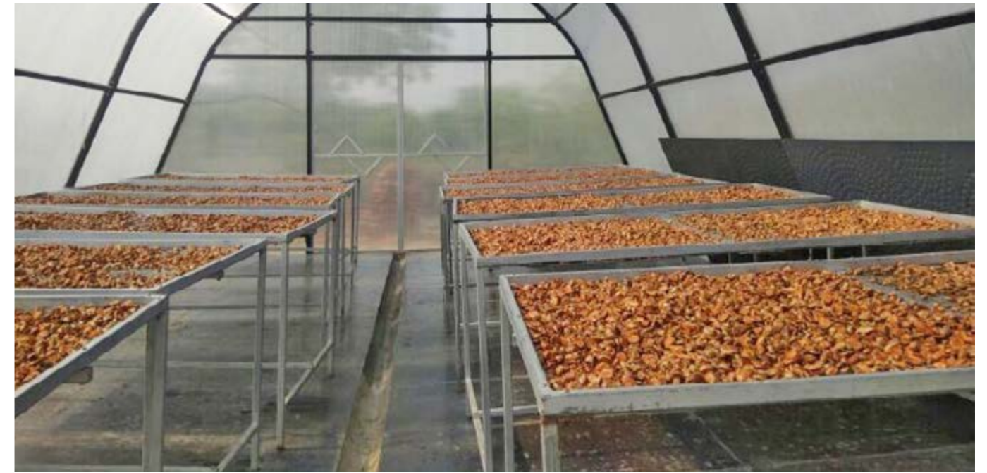
Hi tech Solar dryer