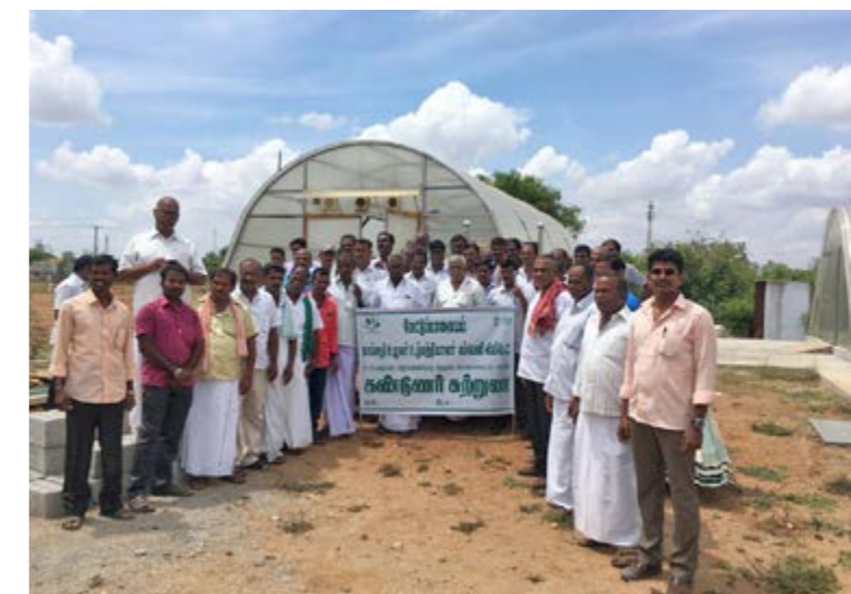
Visit to Solar dryer unit.