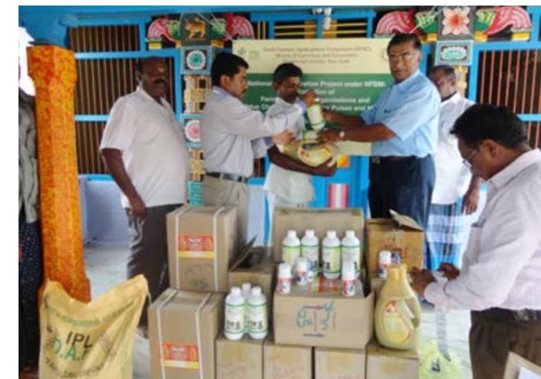
Demo material distribution for green gram.