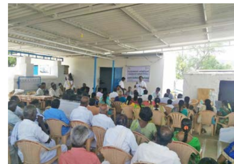
1st Annual General Body meeting.