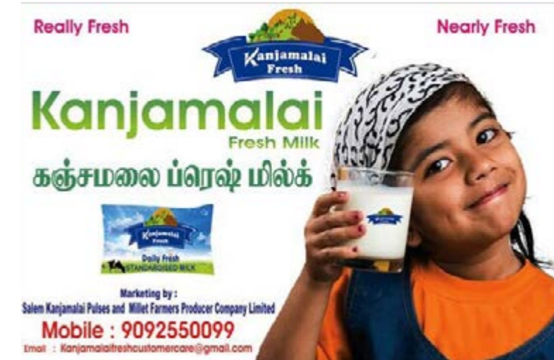
Branded milk for sale.