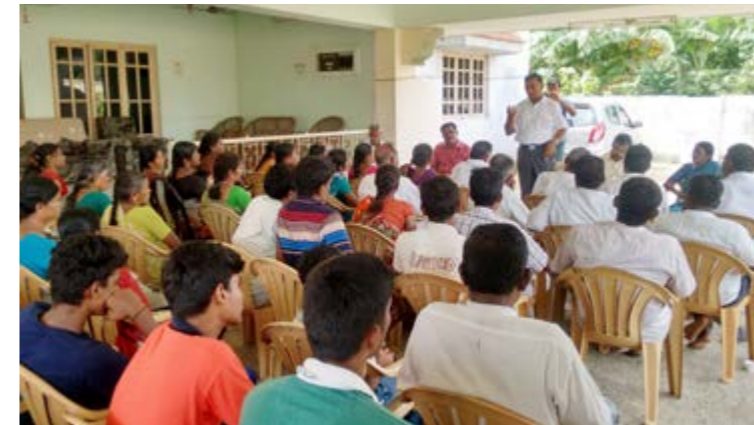
Farmer Producer Group Meeting on business plan

Sponsor: TN- SFAC, Department of Agricultural Marketing and Agri Business Rl: Erode Precision Farm Producer Company Ltd, Sivagiri - 638 109, TN. erode.precision@gmail.com FPO Project Period : 2016 -2019