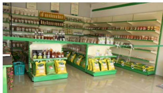
Retail Network shops