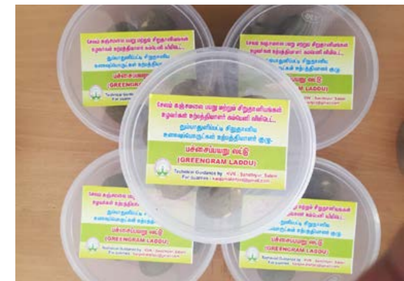
Millet value added products.