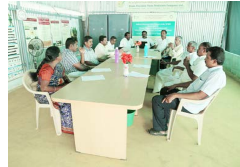
Board meeting in session.