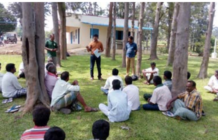
Informal meeting of Farmers to form FPO.