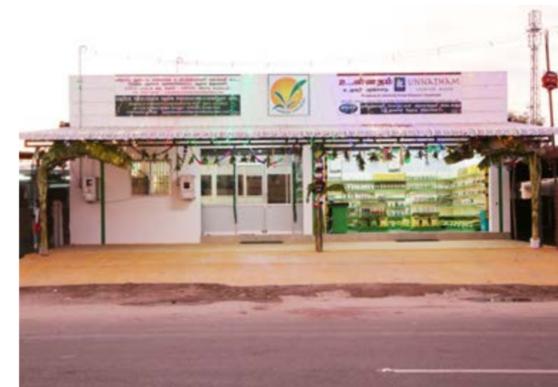
Farmers Super Market