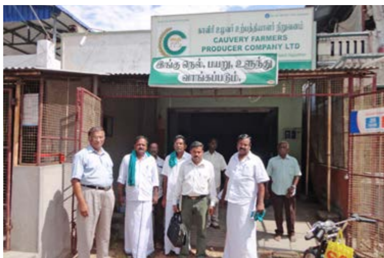
BoDs at Cauvery Farmer PC Ltd