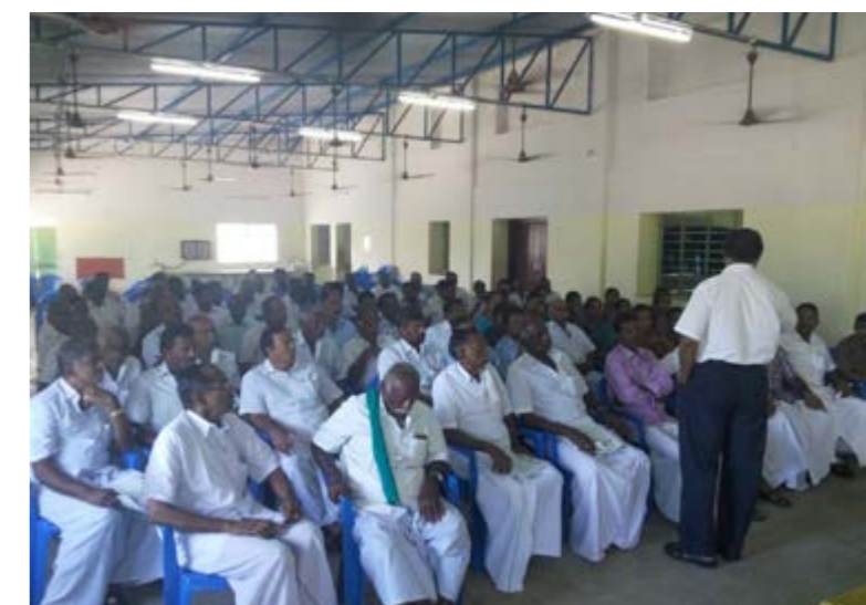
AGM of Namakkal FPO.