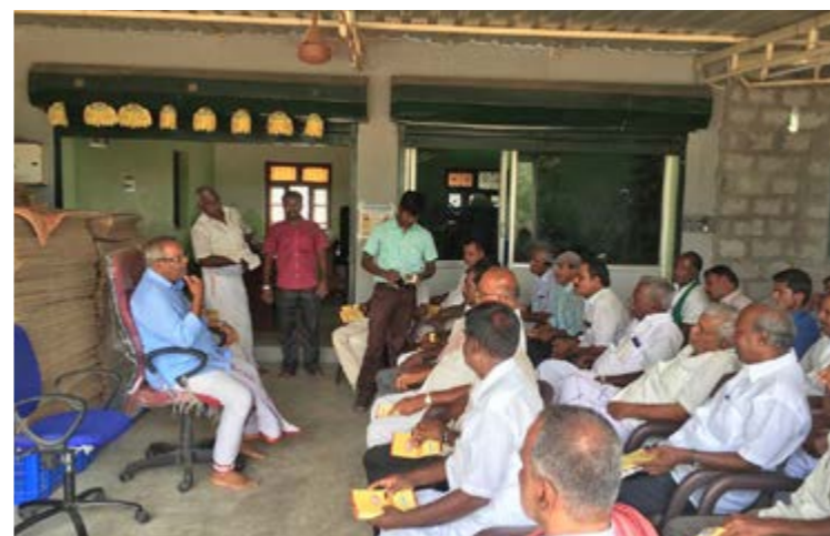
FIG discussion on solar dried fruit and vegetable business.