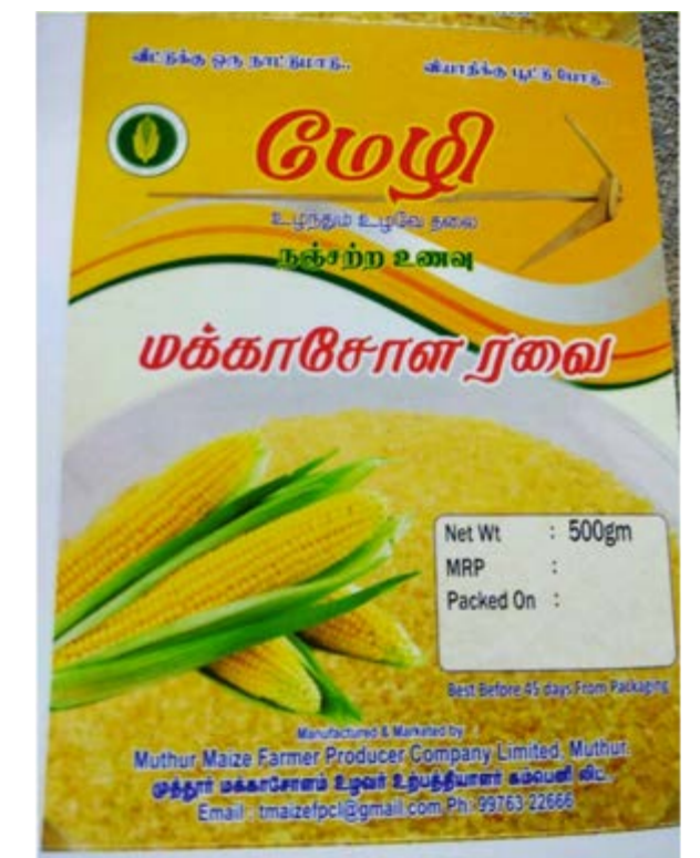
Branded Rava form Maize.