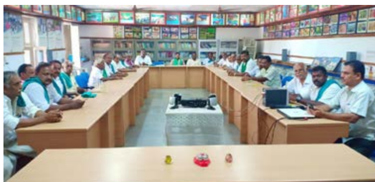
Training to Nagai farmers at Mulkannor Farmers Society.