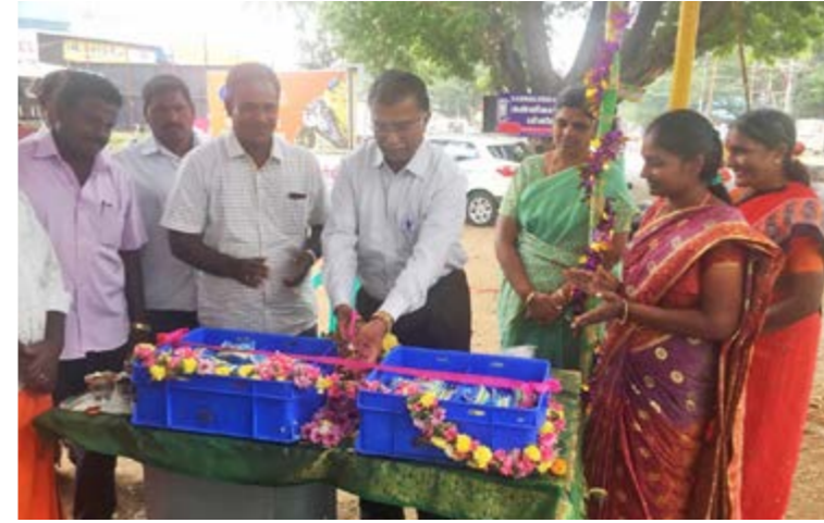
Milk trade launching by Thumpathulipatti FIG.