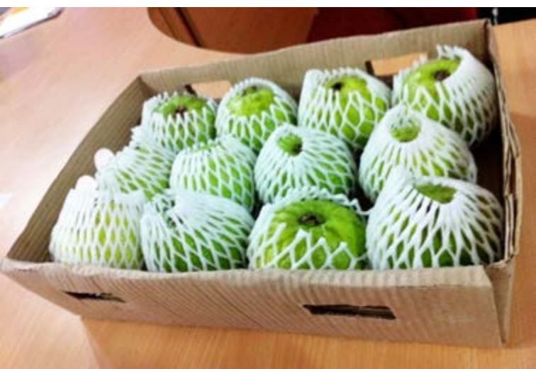
Ultra High Density planting of guava.