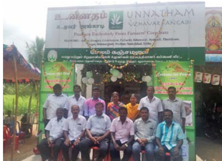
Unnatham Uzhavar Angadi ( Farmer Super market ) retail net work.