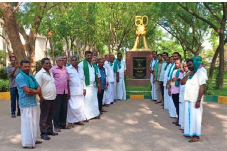
FPO lead farmers visit to Mulkanoor, AP