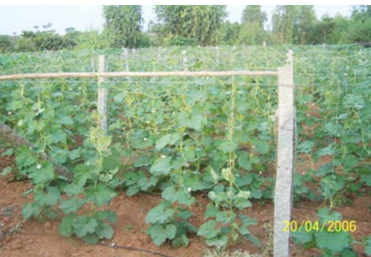
High Tech Bitter Gourd field.