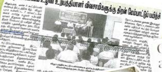
கட்டுப் பண்ணைய உழவர் உற்பத்தியாளர் விவசாயிகளுக்கு திறன் மேம்பாட்டுப் பயிற்சி