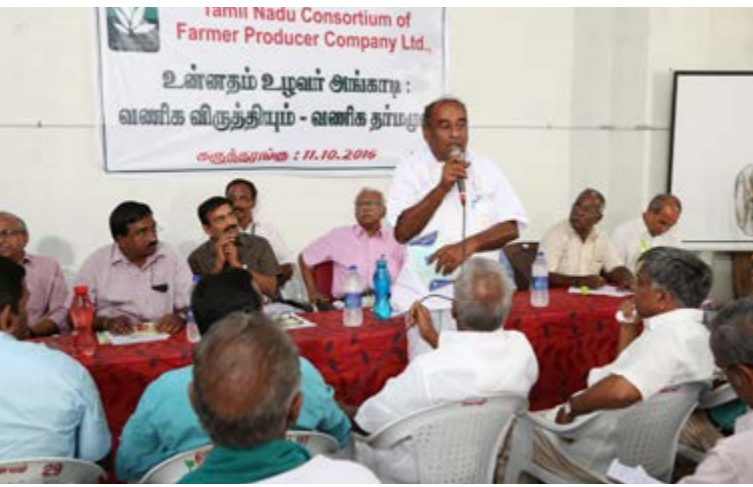
Work shop on Business promotion and business ethics.