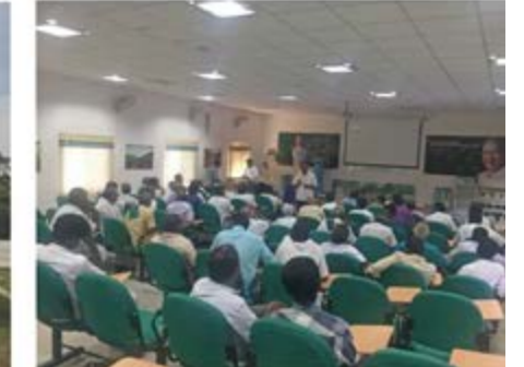
Exposure visit of FPO farmers.