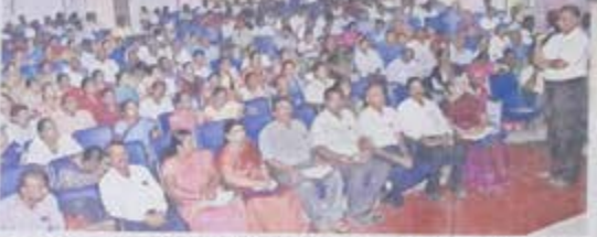
A group of farmers sitting in a hall during a seminar.

சென்னை: உழவர் உற்பத்தி குழு விவசாயிகளின் தோழன்