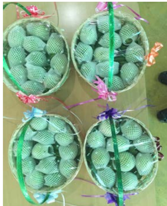
Guava bouquet as commercial product by Ayakudi Guava FPC Ltd