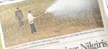
Collective farming in the Nilgiris and Jodhpur districts