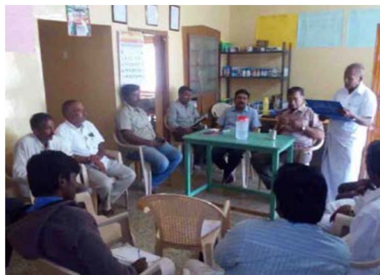
Issue of share certificate of FPO.