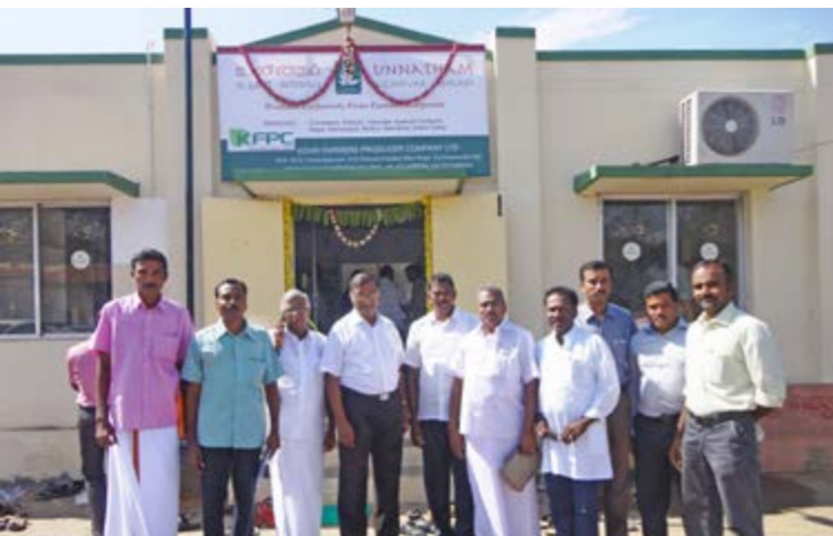
Farmer Super Market at Uzhavar Santhi, R.S.Puram, Coimbatore