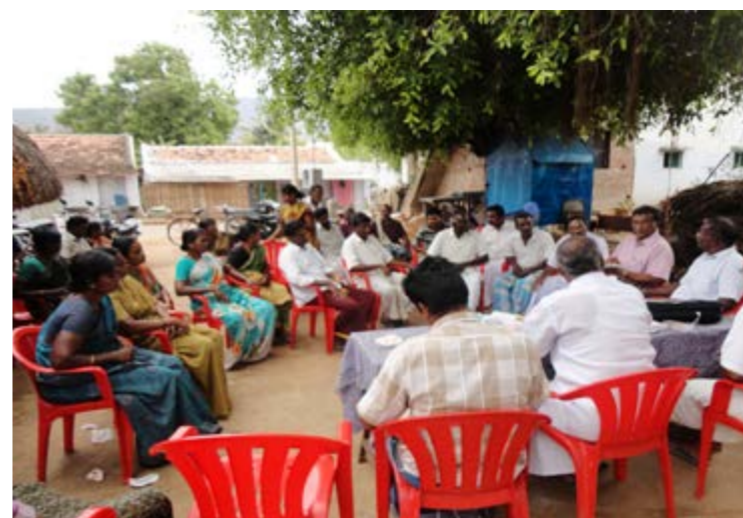
FPO Awareness camp with farmers.