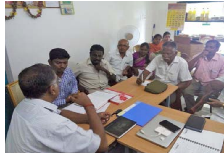
Board Meeting in session.