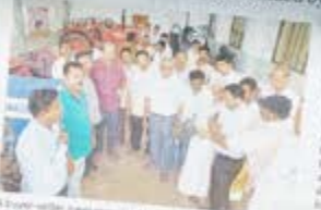
A buyer-seller meet organized under the aegis of the Agriculture Department in Tiruchirappalli

They purchase farm machinery utilising subsidy extended by the government