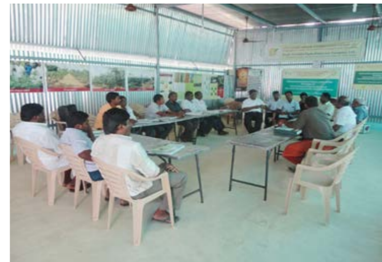
Training to new FPOs