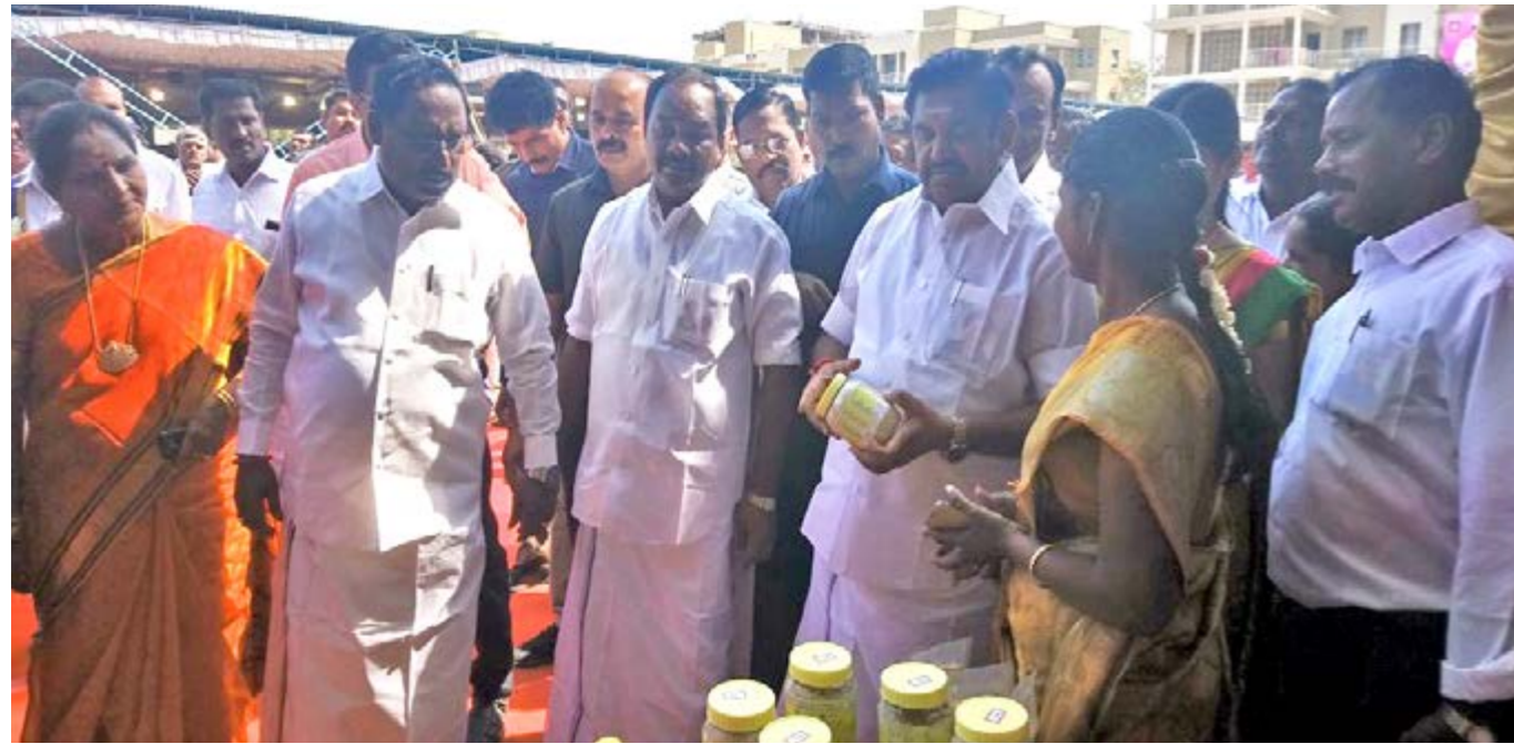
Hob'ble Chief Minister at Kanjamalai Pulses and millets Producer Company Ltd., stall at Salem