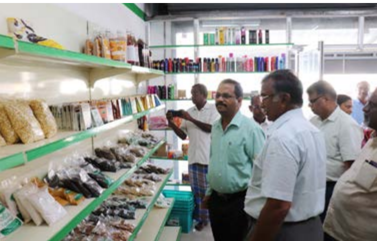
Shri. V. Dhaknamurthy IAS visits Retail food shop