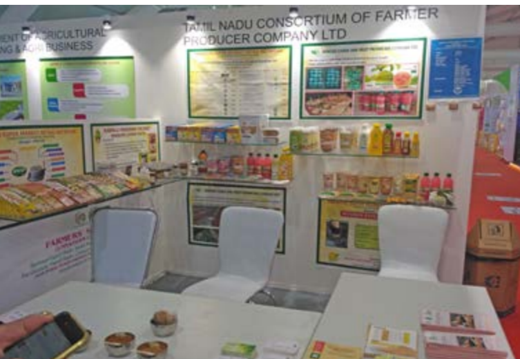
Participation and showcasing of products at World Food India, New Delhi.