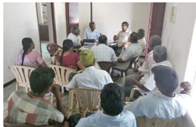
BoD in session on Business plan development.