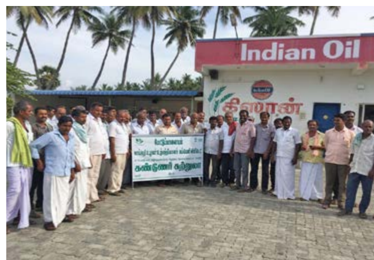
Visit to Erode Precision Farm Fuel outlet.