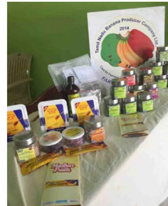
Range of Solar dried value added products