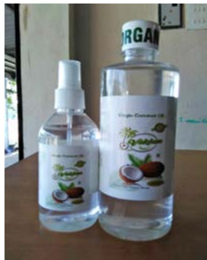
Virgin coconut oil